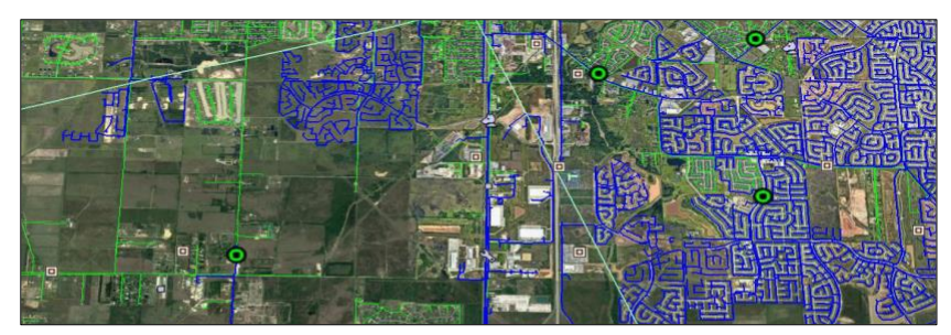
DEF Muni network with fiber in blue, copper in yellow

The FTTH project appears to be in-progress, with several communities having both copper and fiber routes shown.